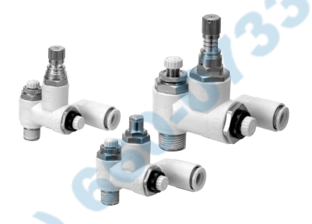
Pilot valve and two-way flow control valve integrated into a single construction